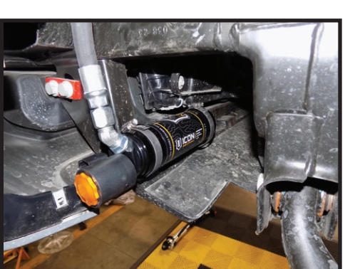
16. Next, you will need to install the differential drop spacers.