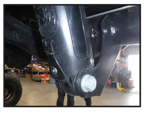
10. Lift the differential enough to connect the shock. Connect the shocks using the factory bolt and a 21mm. [Torque to factory spec] [FIGURE 10 & 11]