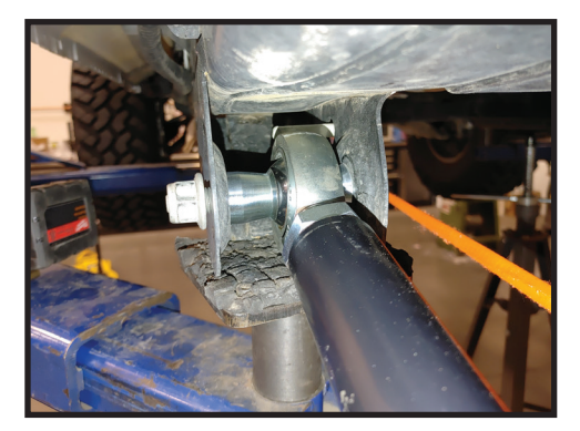
FIG.15 (Driver side shown)

17. Install the either side lower link with the bushing toward the axle housing and the bend near the rearward end pointed up. Insert the heim/spacer into the lower link mount on the vehicle's frame, with the longer heim spacer oriented toward the outboard side of the frame rail [FIGURE 15]. Re-install the OE lower link (frame end) bolt through the mount, heim and spacer.