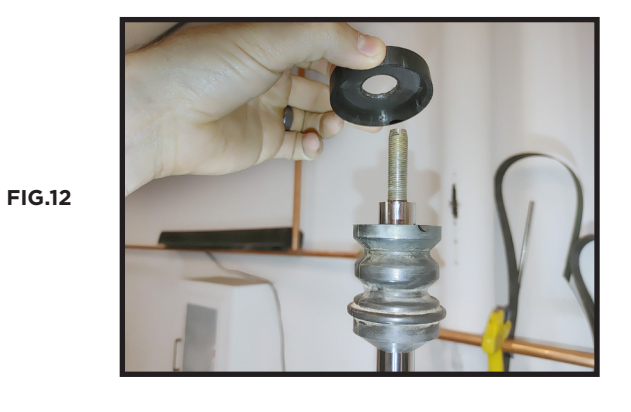
10. If running 37" tires tall tires, remove the spacer on top of the foam bump stop and install part# 611082. [FIGURE 12 & 13]