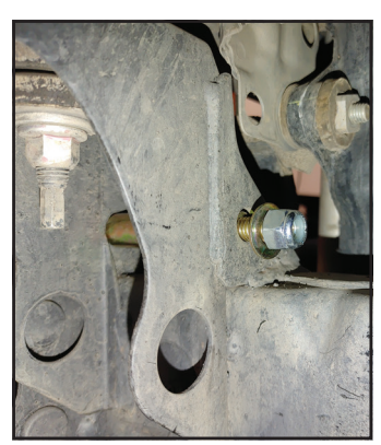
FIG. 23 FIG. 24

22. Install the supplied Edge Guard Trim along the cut edge of the plastic bumper fascia and trim the ends to fit.