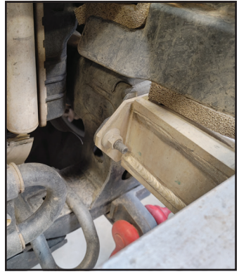
FIG. 12 FIG. 13

13. Remove side crash bars from either side of the front of the vehicle's frame. Use an 18mm wrench or socket to remove the single bolt on each side. Set the side crash bars aside. They will not be reused.