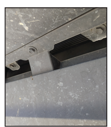
FIG. 10 FIG. 11