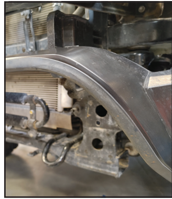
FIG. 25 FIG. 26