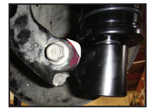
4. Paint any exposed metal to avoid corrosion.