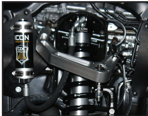
[TECH NOTE #2]

RETORQUE ALL NUTS, BOLTS AND LUGS AFTER 100 MILES AND PERIODICALLY THEREAFTER.