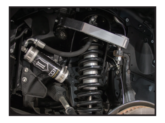
[TECH NOTE #2]