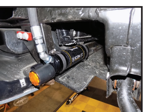
16. Next, you will need to install the differential drop spacers.