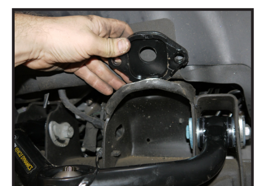
9 . Install the supplied (174037) stem top adapter on top of the shock bucket, taking care to note that the middle hole is offset to bring the shock outward for clearance. Using the supplied 9/16" hardware, fasten the adapter mount using a 13/16" wrench and 7/8" socket. [FIGURE 6 & 7]