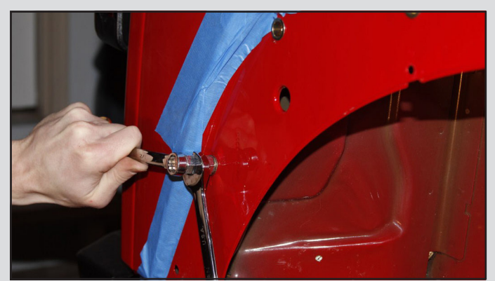
IMAGE MAY NOT MATCH THIS PART INSTALLATION. IT IS FOR ILLUSTRATION OF THE USE OF THE TOOL ONLY.

B. Insert the knurled end of the rivet-nut into the hole, pressing its flange firmly against the Jeep's sheet metal. Use an end wrench to hold the coupler nut stationary while turning the head of the bolt clockwise with a ratchet and socket. As the ratchet is turned, the bolt will draw the far end of the rivet-nut toward the inside of the sheet metal, gripping it with the knurled outside edge of the nut-sert as it deforms.