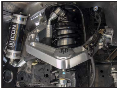
[TECH NOTE #2]

RETORQUE ALL NUTS, BOLTS AND LUGS AFTER 100 MILES AND PERIODICALLY THEREAFTER.