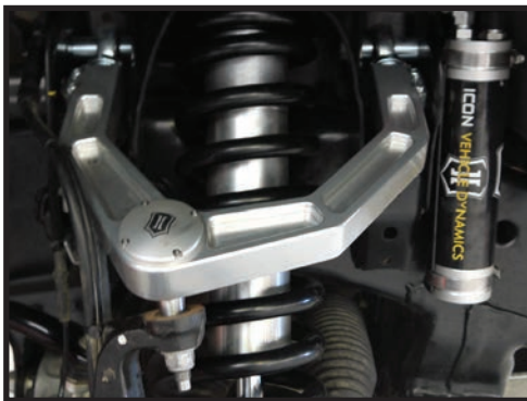
[PASSENGER SIDE SHOWN]