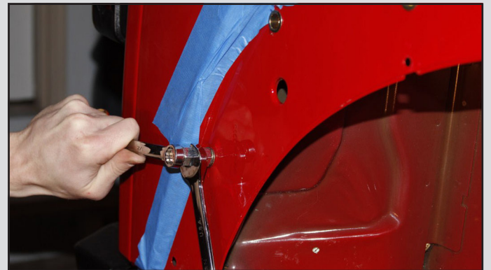
IMAGE MAY NOT MATCH THIS PART INSTALLATION. IT IS FOR ILLUSTRATION OF THE USE OF THE TOOL ONLY.

B. Insert the knurled end of the rivet-nut into the hole, pressing its flange firmly against the Jeep's sheet metal. Use an end wrench to hold the coupler nut stationary while turning the head of the bolt clockwise with a ratchet and socket. As the ratchet is turned, the bolt will draw the far end of the rivet-nut toward the inside of the sheet metal, gripping it with the knurled outside edge of the nutsert as it deforms.